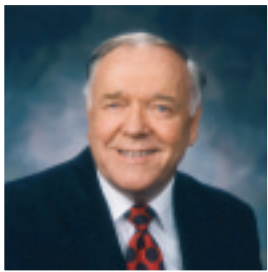
Kenneth E. Hagin

Satan is the author of sickness and disease. I know that now. So I'm not afraid of sickness and disease, and I will not have sickness and disease. If Jesus tarries His coming, I'll die without sickness and disease.