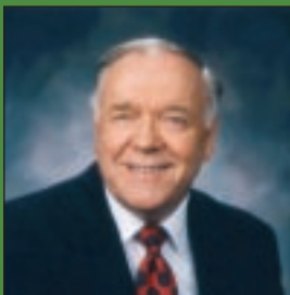
Kenneth E. Hagin

Everyone wants to be successful in life, and many books have been written claiming to teach the way to success. But only one Book, written long ago, holds the true key.